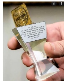
Pictures from the web, the left from a Houston Chronicle article in 2014