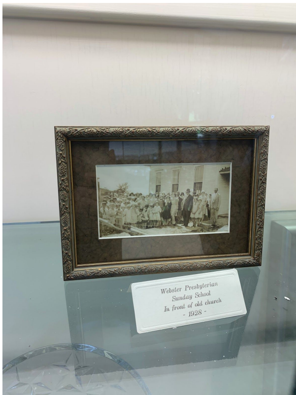
Webster Presbyterian Sunday School In front of old church - 1928 -