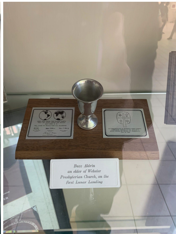
Buzz Aldrin an elder of Webster Presbyterian Church, on the first Lunar Landing