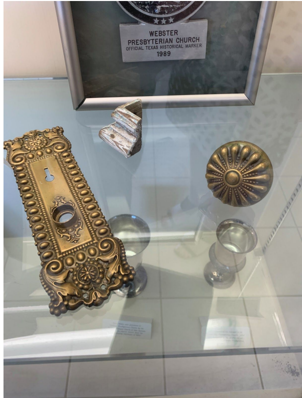
WEBSTER PRESBYTERIAN CHURCH OFFICIAL TEXAS HISTORICAL MARKER 1989