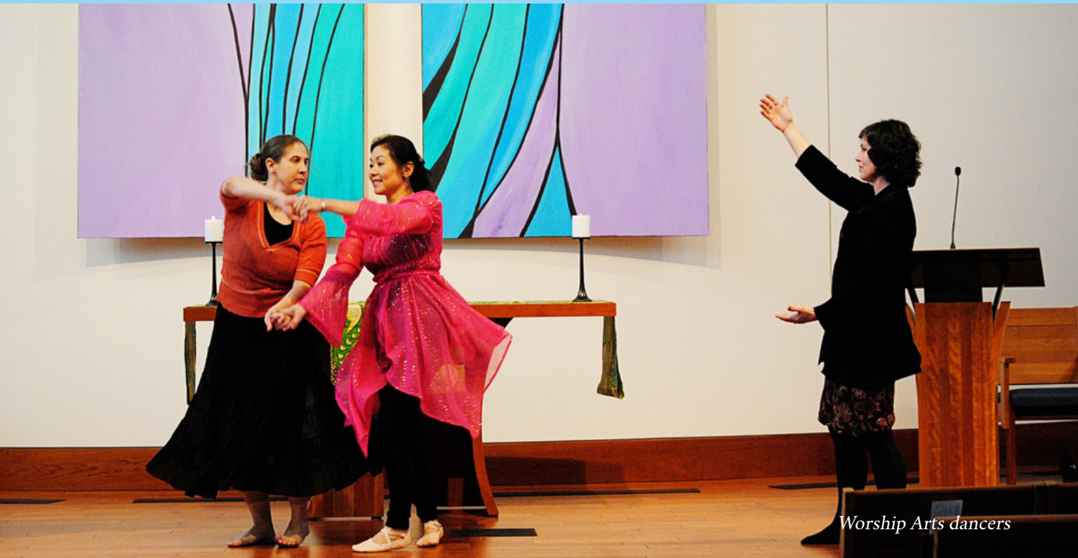
Worship Arts dancers