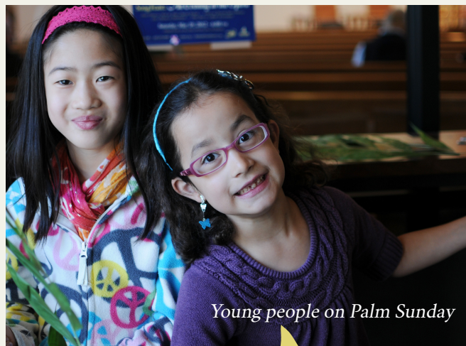
Young people on Palm Sunday