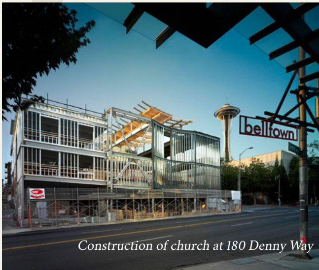
Construction of church at 180 Denny Way

The new church building, homeless shelter and parking garage were carefully planned to meet our congregation's long-term ministry and outreach needs. This plan was based on matching the costs of the new building with money from the sale of our old property and from the 2009-2011 capital campaign. However, the recession that started soon after the sale of our former church property negatively impacted the implementation of this plan. First, a $1 million pledge from the sale of our former property is dependent on redevelopment of that property. Second, there was a shortfall in the campaign pledges of approximately $400,000 due to the significantly reduced financial