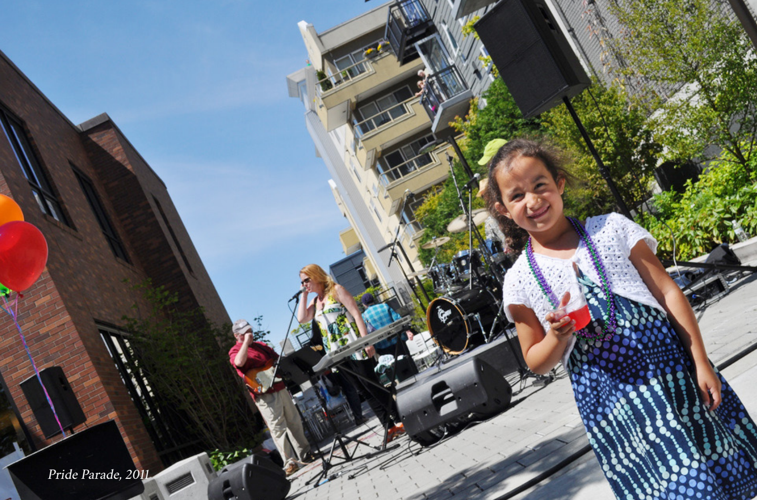
Pride Parade, 2011

The church has been using these funds to make the mortgage payments since the end of construction. Once the reserved capital campaign funds are depleted, mortgage payments will have to be made from our annual operating budget.