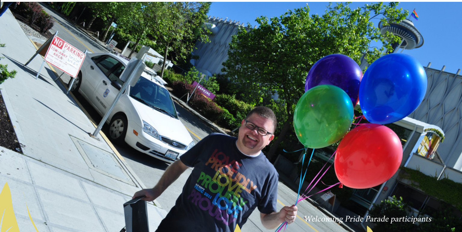
Welcoming Pride Parade participants