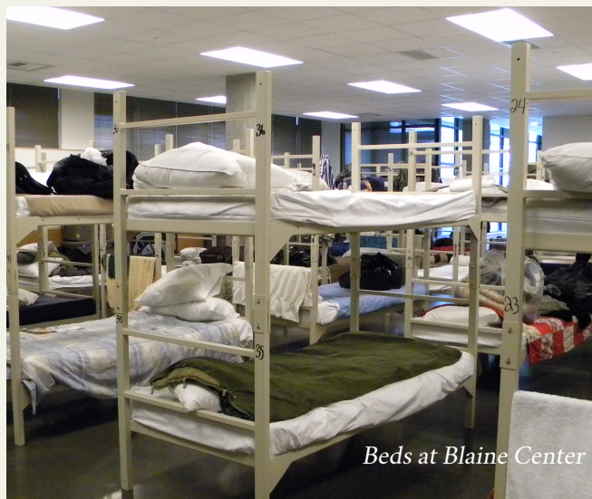
Beds at Blaine Center

A team of church members has been working for the