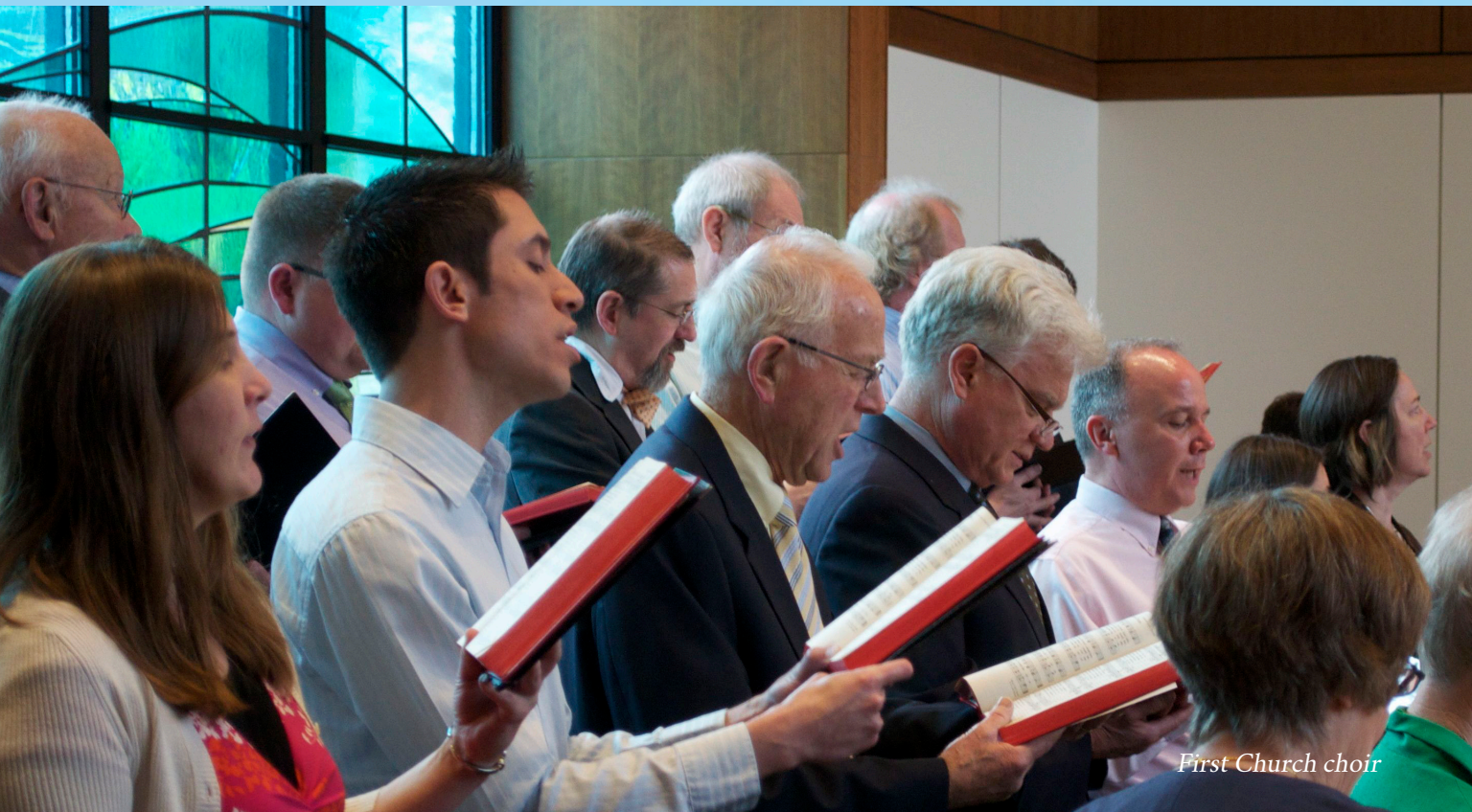
First Church choir