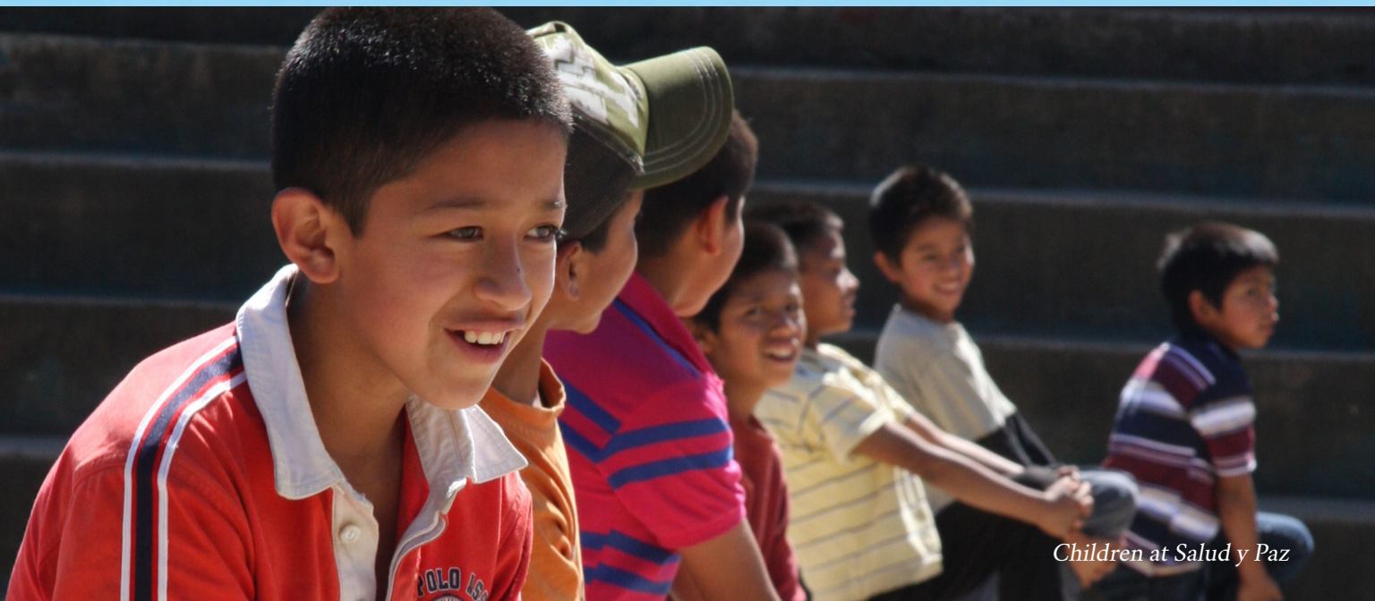
Children at Salud y Paz