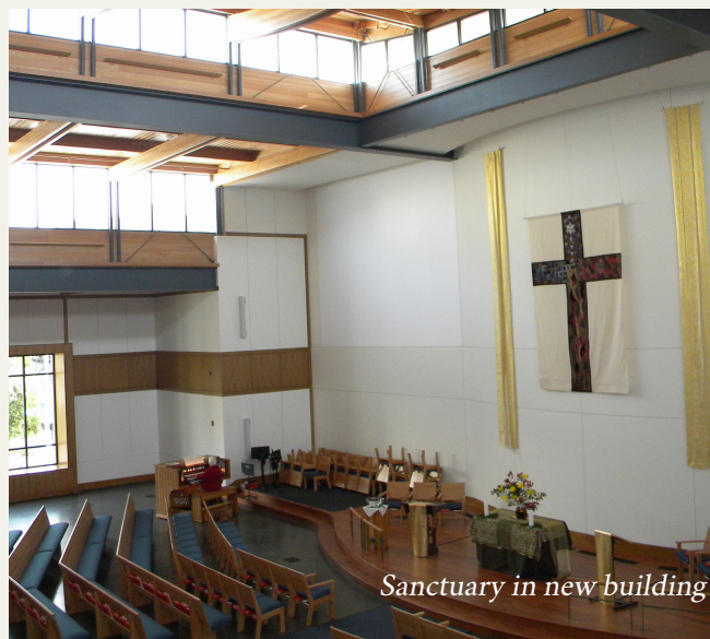
Sanctuary in new building

The terms of the mortgage are repayment over 20 years with an interest rate of 6.49%. The monthly payment required is $13,768 for an annual cost of $165,216. There is no pre-payment penalty. And we can refinance the loan but there is a fee of 1.5% of the outstanding loan balance. If we were to refinance, the current rate available from the United Methodist Development Fund is 5.5%. We started making payments on the mortgage in April, 2010. As of March 1st, the remaining principal on the loan is $1.773 million. A decision by the Church Council on March 7, 2012, allocated church savings to